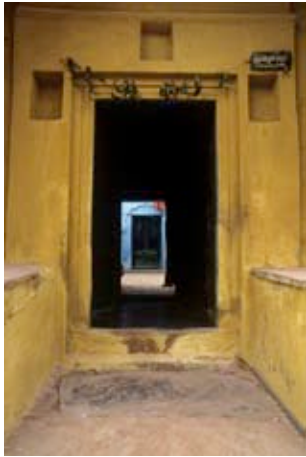
Mathura, Uttar Pradesh