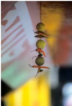
Kolkata, West Bengal