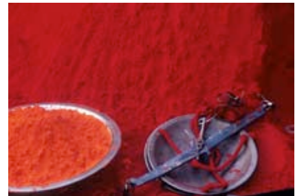
Omkareshwar, Madhya Pradesh