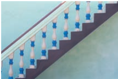
Madurai, Tamil Nadu