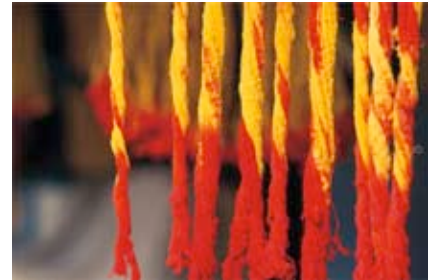
Gangasagar, West Bengal