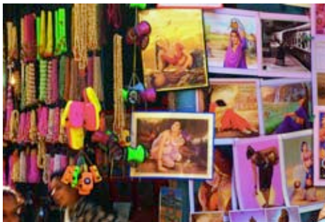
Maheshwar, Madhya Pradesh