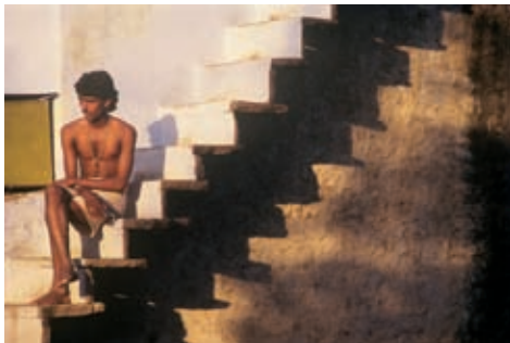
Brindaban, Uttar Pradesh