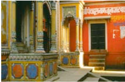
Varanasi 2, Uttar Pradesh